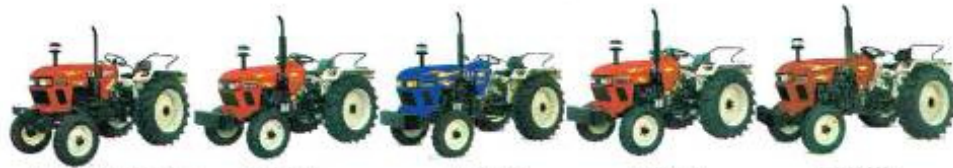
EICHER 242 Xtrac Premium