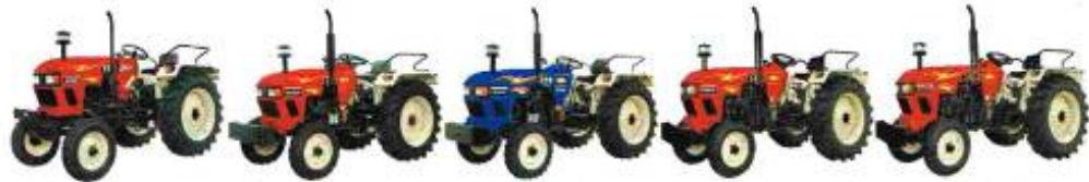
EICHER 242 Xtrac Premium