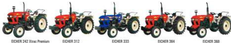
EICHER 242 Xtrac Premium