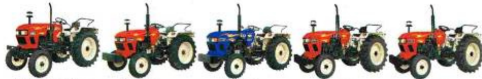
EICHER 242 Xtras Premium