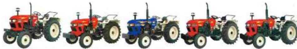
EICHER 242 Xtrac Premium